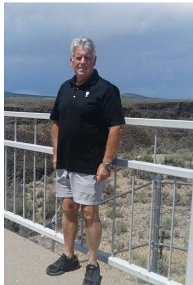
At Rio Grande Canyon