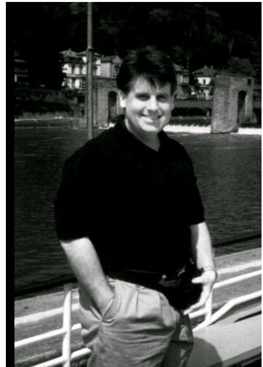
Heidelberg on the river