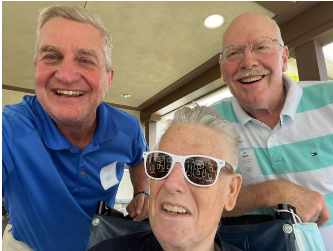
at Waverly Heights, Sep 2023